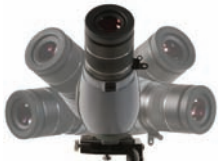
Adjustable viewing angle.

Rotate the tripod mounting collar for greater flexibility in the field.